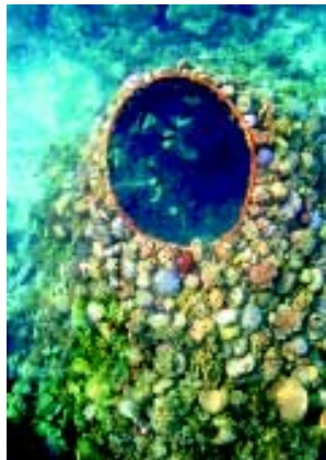
Close up view of one of the artificial reef “barnacles” sitting at eight metres on the house reef of Ihuru Island.

Naturally settled corals, attached corals, coralline algae, bivalves and other organisms thrive on the “barnacle” reef.