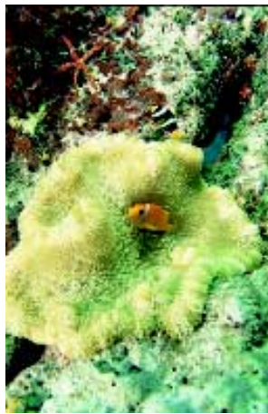
A bleached anemone, some have recovered, many have perished.

but at the same time proved the success of the project. Though all Acroporas on the artificial reef perished, 80% of the Porites coral species survived as compared to less than 10% on natural reefs. Realising the implication of the impact, the resident guardian of the project, Mr. A. Azeez A. Hakeem, immediately went out to collect surviving specimens of hard corals. They were transplanted onto the "barnacles" to monitor for growth rates, as well as to facilitate ongoing assessment. One species of Porites, Porites rus , was noted to be the most successful in surviving the warm water conditions. With the absence of Acroporas, the diets of some marine animals were expected to change. Drupella, a marine snail that preys on Acroporas, was found feeding on the Porites species on the "barnacles". With the aid of his staff, Azeez collected over three kilograms of these miniature snails for the Marine Ministry. Parrotfish were also observed to have acquired a taste for Porites.