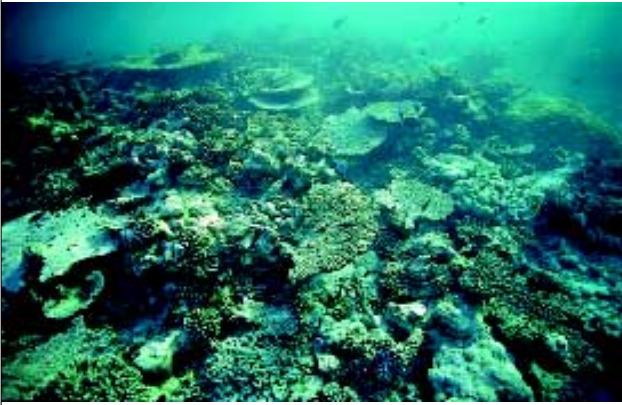
Fringing reef, South Male Atoll, after the bleaching event of April 1998.

When corals are stressed by high water temperature, the zooxanthellae — the life-supportive symbiotic algae that provide them with nutrients — are voluntarily expelled from their tissues. Initially the process will only weaken the coral, but if warm water conditions persist the corals will eventually die. Affected corals turn stark white as the life-giving zooxanthellae are lost and the coral polyps cannot survive — scientists therefore commonly refer to this phenomenon as “bleaching”.