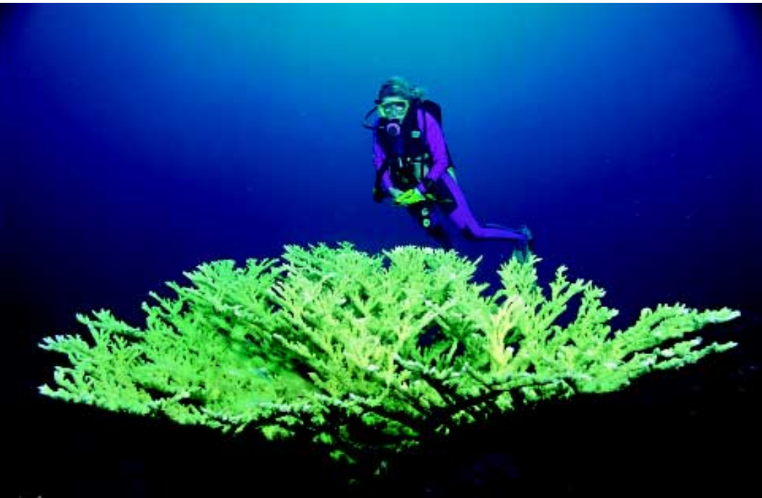
Magnificent Acropora colonies measuring up to three metres in diameter which thrived in the Felidhoo Atoll perished during the El Niño year of 1998.