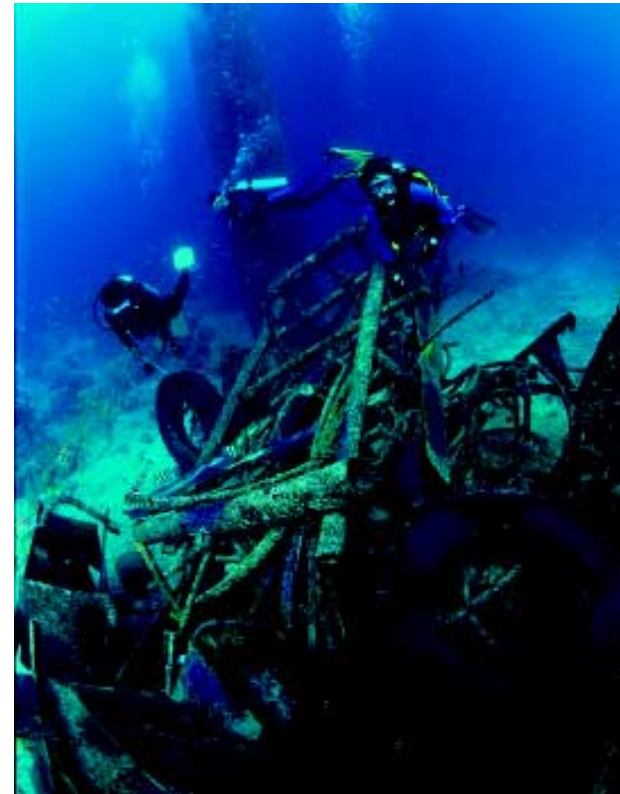
“First generation” artificial reef – rather than becoming part of the organic marine environment, these structures will always remain foreign objects.

Once the material is in place, the intention is that it will act in the same way that naturally occurring rock outcrops do by providing the hard substrate necessary for the basic formation of a live-bottom reef community. Though many structures are successful in attracting a myriad of living organisms to settle, just as many remain as a junkyard beneath the sea. The resulting habitats, though serving as fish aggregation devices, far from resemble coral reefs and contribute little or nothing to the regeneration of coral reefs. Thomas Goreau refers to these as “first generation” artificial reefs.