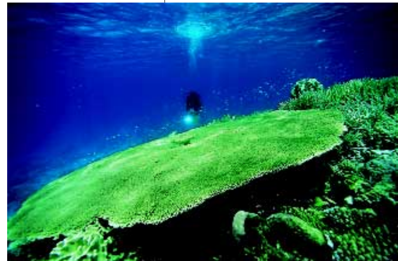
Lush hard coral meadows in pristine condition were very common in the Maldives prior to April 1998.

Global warming is very real and coral bleaching events like the event of 1998 are anticipated to occur more frequently than before, and many regions of the world's ocean may become unsuitable habitats for reef-building corals. In the process, other areas, previously offering the right conditions for coral growth, may become too hot or cold to sustain reef builders and their ecologies. Under such circumstances, solar-based third generation artificial reef technology may have a crucial role to play in helping to preserve marine biodiversity, facilitating effective shore protection, providing ecologically sound reef-building materials, and thereby contributing to maintaining the quality of the world ocean.