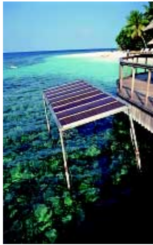
A set of eight solar panels – costing about US$200 – is used to power the “barnacles”.