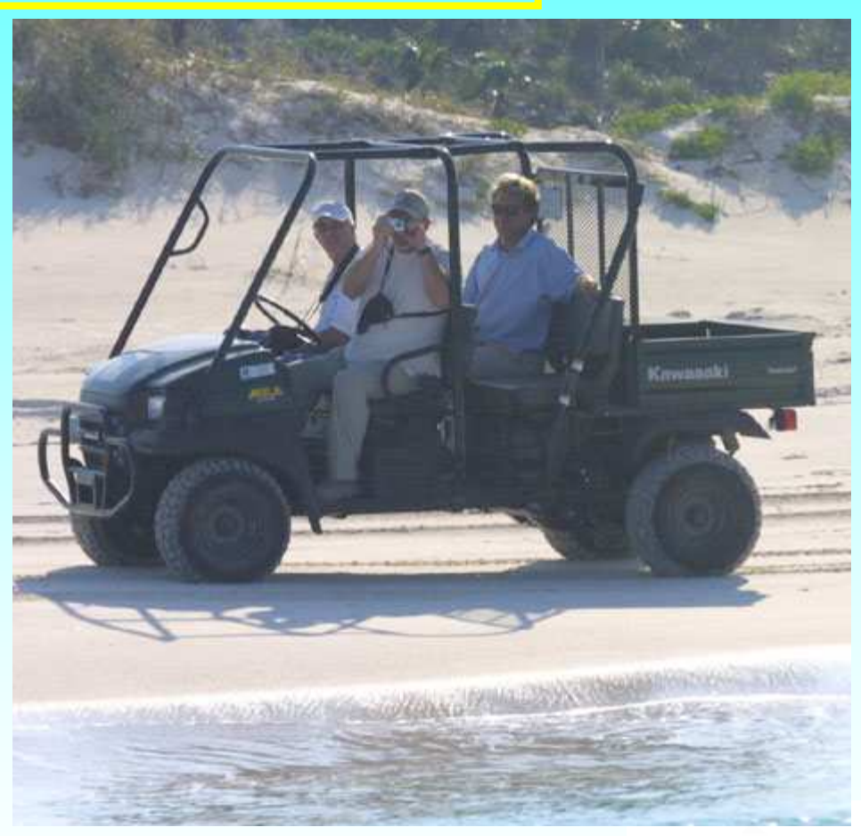
COCCT THE LOCALS