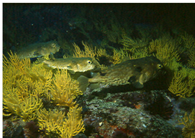
Figure 3. Typical ahermatypic Gorgonian soft corals, Cap Verde Peninsula, Senegal, 1984.

Observations by the author are contained in the Table 1. The importance of traditional knowledge by fishers in understanding what is causing the demise of a coral reef or fishery cannot be over-emphasized [18]. In the case of Belize (See observations by fishermen in Table 1), this insight was critical, where the