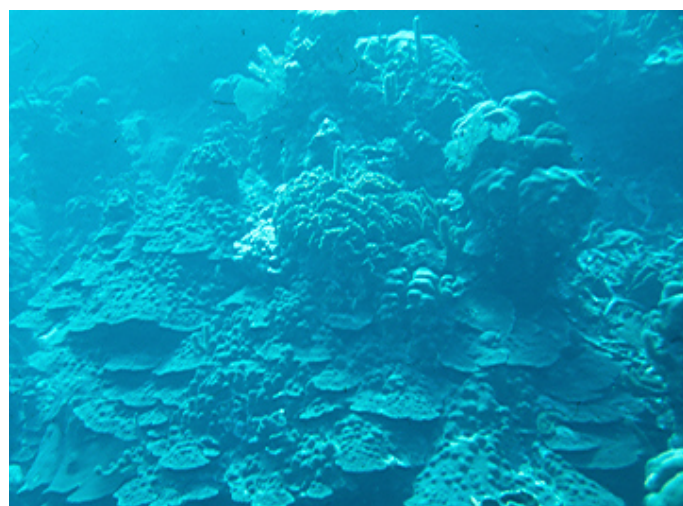
Figure 1. Structurally sound coral reef at 30 m. depth, Roatan, Honduras, 1977. These reefs were coral dominated while algae were a minor component of this ecosystem [2,14].

With regards to CBNRM and marine fisheries, fishermen are often victims of land-based pollution that results in nutrient/sediment pollution from sewage and gray water associated with tourism, as well as runoff from agricultural lands with the net result of corals being smothered by epiphytic algae and sediment; and pesticides from agricultural runoff [2,14,17]. Once the habitat is degraded, the fishery is degraded, adversely impacting the lives of fishing communities that have thrived for generations on what were once pristine ecosystems. This is primarily an issue with reef-building (hermatypic) corals that depends on the symbiotic relationship between coral polyps and unicellular algae called zooxanthellae (Figures 1 and 2). Zooxanthellae are symbiotic dinoflagellate algae living within the coral polyp providing its coral color and food from photosynthesizing. Zooxanthellae provide oxygen and recycle phosphates and nitrates from the coral’s waste products, enabling an entire ecosystem to develop in unproductive, nutrient poor water. Efficient and rapid recycling of these nutrients results in the tropical world’s coral reefs being one of the most productive