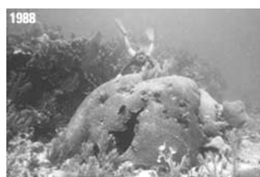
In 1988, following Hurricane Donna of 1960, the giant brain coral is still healthy.