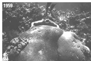
In 1959, this large Colpophyllia natans (giant brain coral) was healthy and intact.

• As noted, an important recommendation to ecologists and researchers is to take advantage of the incredible insight and knowledge of fishers and other traditional natural resource users of natural history and the environmental changes impacting these resources. The author has been humbled many times by the incredible knowledge of the fishers in Caribbean/Central America/Africa to the Mandinka hunters in the savannas of West Africa, to the Baka and Batwa Pygmies in the dense humid lowland forests of the Congo Basin, to the Bushmen of Namibia and Botswana. More than any other, in Belize local fishers explained how man, as described above, in Belize and surrounding countries adversely impacted the coral reefs and lobster fishery as a result of land-use changes and resulting land-based pollution. It is imperative that the knowledge of traditional hunters, herders, fishers, etc. be taken advantage of. The ecologist is trying to understand what has happened while looking at a window in time, while the traditional resource user is in the field every day seeing change take place, in addition to generations of knowledge and insight handed down to him/her by their ancestors. Some of the most insightful and intelligent