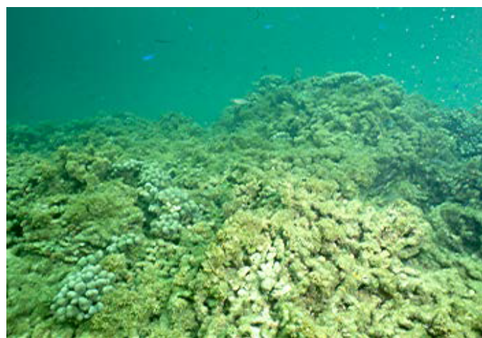
Figure 4. Porites porites "finger coral" being smothered by macro-algae, Dictyota sp., from inappropriate septic tanks, Grand Anse Beach Grenada, 1988. Similar patterns are seen around densely populated coastal areas and tourism areas worldwide [2,14].