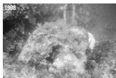
By the summer of 1998, most of the giant brain coral is dead and covered with epiphytic (benthic) algae and sea whips (Gorgonian corals).