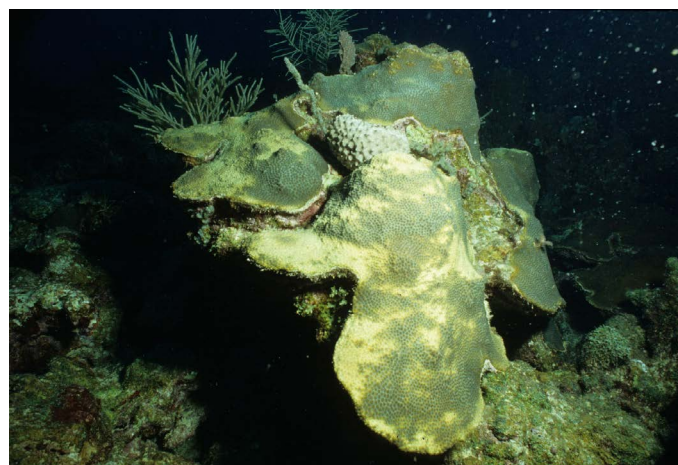
Figure 5. Coral bleaching, West Coast, Barbados, 1988/1989; zooxanthellae giving, coral color, have been extruded, but coral is still alive [2].

1990s, bleaching became a regular and pervasive problem in the Caribbean and began to appear in the Pacific and Indian Oceans -- often related to El Niño events. During the El Niño of 1997-1998, bleaching began in the eastern Pacific but then expanded to an unprecedented, alarmingly broad region across the Indian Ocean from Kenya to Indonesia and in the Pacific Ocean from Australia to Polynesia [2].